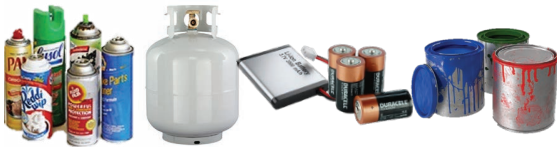
Aerosol Cans, Propane Tanks, Batteries & Paint Cans