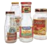
Clear Bottles & Jars