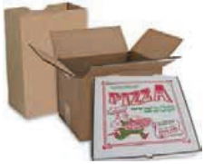
Cardboard & Pizza Boxes Flatten cardboard. Remove wax paper from pizza boxes