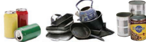
Aluminum Cans, Metal Cookware, Steel & Tin Cans