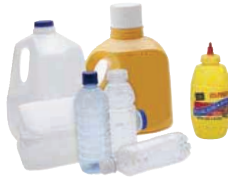
Jugs & Bottles with Small Top Openings