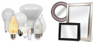
Light Bulbs & Plate Glass/Mirrors