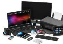
Electronics, Cords & Christmas Lights