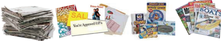
Newspaper, Office Paper, Paper Bags, Junk Mail, Paperboard & Magazines

Paper Place loose in cart. Use clear plastic bags for shredded paper ONLY .